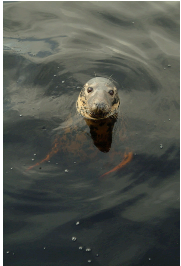
Seals in Scotland's Outer Hebrides love eating seaweed

Seagreens' dried milled single species make ideal food ingredients and condiments, while its mixed species in capsules and granules provide a comprehensive nutritional foundation for all ages and health conditions for easy everyday use and in nutritional therapy. Seagreens products replace all the important micronutrients (eg. minerals, vitamins) lacking in agricultural soils and nutrient-altered manufactured foods. The inadequacy of these nutrients is well documented - the root of most modern health concerns. "Food availability is not the issue. The quality of food is the problem" (United Nations, 2006).